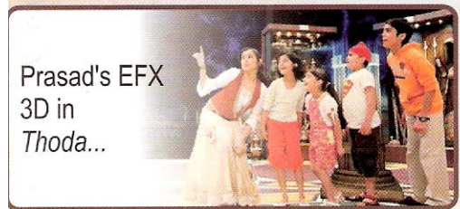
Prasad's EFX 3D in Thoda...