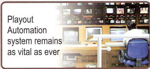
Playout Automation system remains as vital as ever