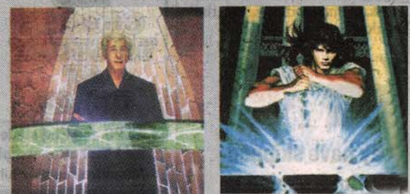
The villain, Dr Siddhant Arya creates substances which can destroy the world. Sounds (and looks) similar to Kryptonite (right), the green element from Superman's native planet of Krypton, which weakens the superhero

Tony Ching Siu-Tung Around Rs 10 crore has gone into the 90 minutes of action sequences. The man behind it is Tony Ching Siu-Tung, a Hong Kong film director and action choreographer, whose works include the critically acclaimed supernatural fantasy, A Chinese Ghost Story (1987), Shaolin Soccer (2001), Hero (2002), and House of Flying Daggers (2004). Desi action director Shyam Kaushal has also worked on the film.