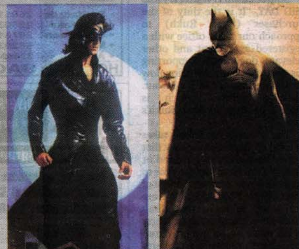
(Left) Still from Krrish and (right) still from Batman Begins (2005)

One of the songs is pictured at a carnival, where people are wearing masks. The song continues into a circus, where a short circuit leads to a tent catching fire. The circus performers get stranded on top and start screaming for help. Krrish realises that he can help them. He sees a slightly burnt mask lying on the ground nearby and wears it to hide his identity. Then he saves the stranded performers. This makes him a national hero and a nationwide search is launched for the Masked Man.