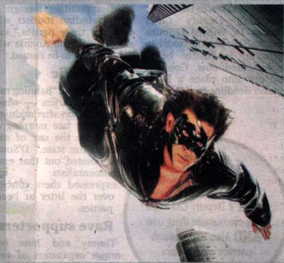
(Above) Hrithik Roshan as Krrish and (below) Christopher Reeve as Superman