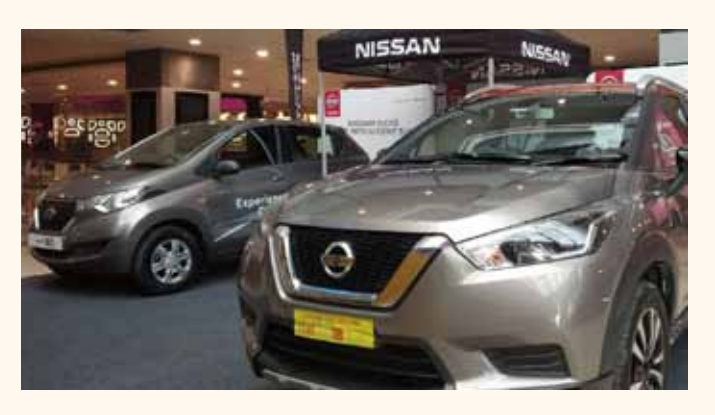
The latest model of Nissan KICKS was displayed for promotion at PRASADS in the main Atrium of the Mall.