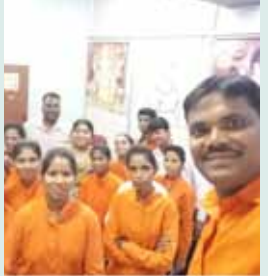
PRASADS Multiplex & Mall conducted an induction program for its new employees as part of its regular training and development activities.