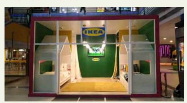
IKEA conducted a brand promotion activity in the Atrium of PRASADS Multiplex & Mall.