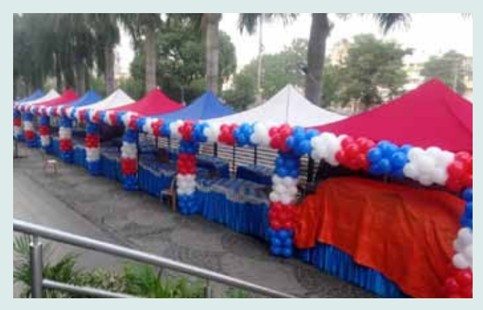
PRASADS Multiplex and Mall was in all its Christmas Glory for the festive season. A large number of visitors were present enjoying the festive atmosphere and having great fun.